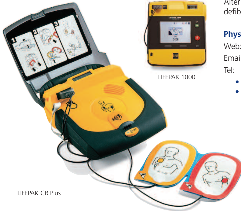
LIFEPAK CR Plus

You can purchase a defibrillator from us if you opt for us to manage your accreditation package. Alternatively, the following manufacturers have defibrillators that are suitable for public-access use: